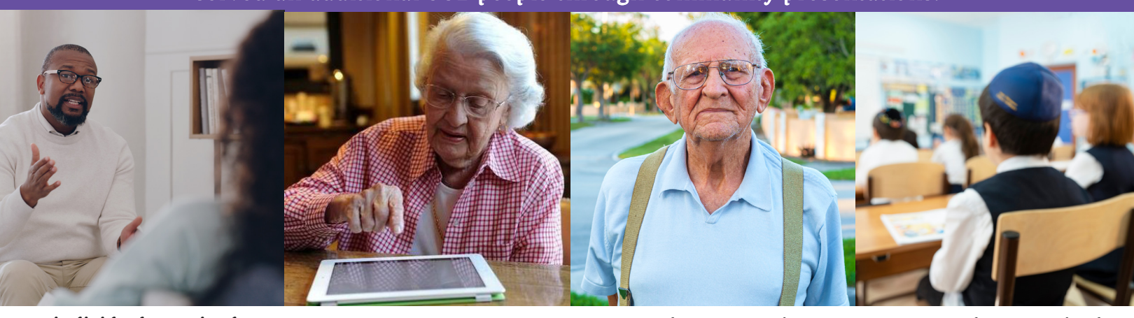
601 individuals received over 9,139 hours of behavioral health services.

Mind U engaged 108 class and 365 workshop participants and served an additional 982 people through community presentations.