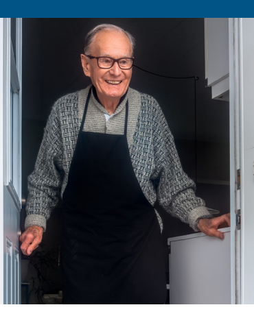
Kosher Meals on Wheels delivered 37,538 meals.