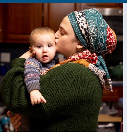
208 individuals called the Lev Detroit Resource Line. We served 443 Orthodox clients, providing 3,646 hours of services.

86% of individuals felt their quality of life and wellbeing improved with counseling services.