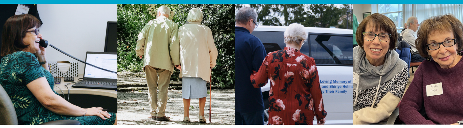
7,370 calls were answered by our Resource Center.